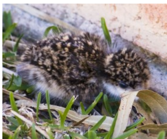
Chick - Sussex Inlet