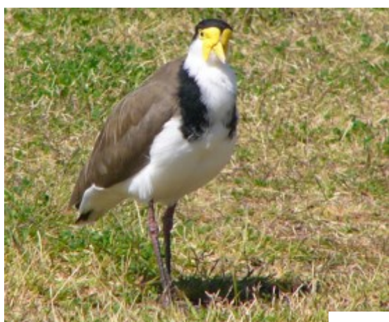
Adult - Sussex Inlet

Voice. A loud "kekekekek", often heard at night as the birds fly to another location.