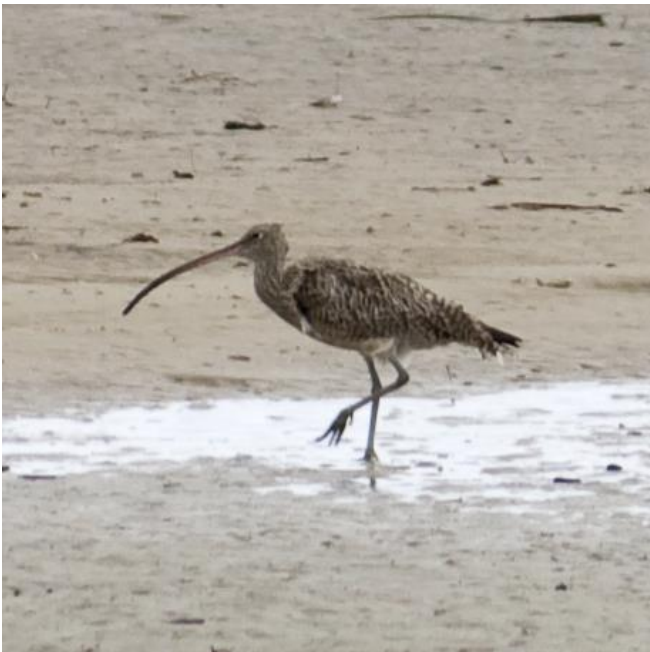
Male, Taren Point

Voice. Described as beautiful, haunting yet melodious. A two part "Cur-lee", rising on the second note.