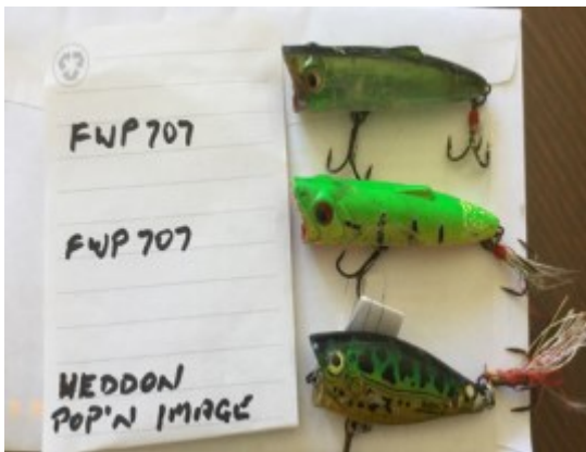
Favourite bass lures as used (very successfully) in daylight hours in the river around Alstonville.