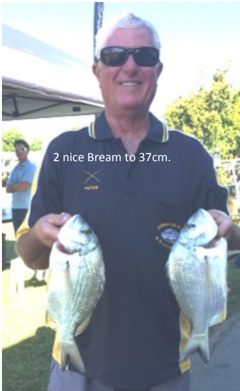
2 nice Bream to 37cm.