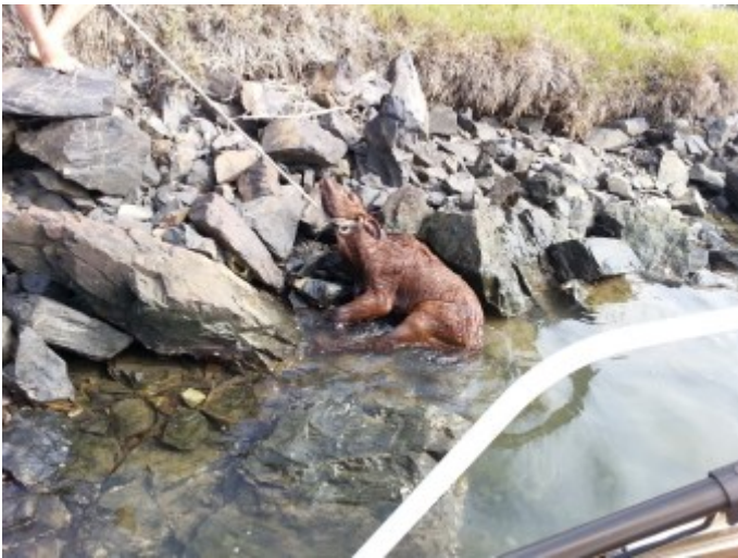
The lasso is has found its mark