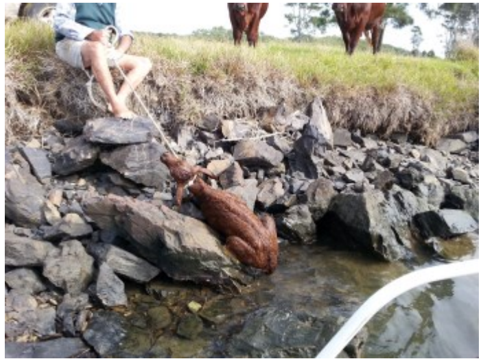
The deckie in action