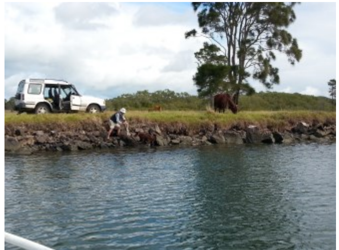
The lasso is readied—that's mum on the right

This Claim Form was accompanied with the following photos.