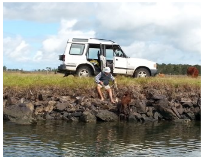
The poddy keeps moving out of reach