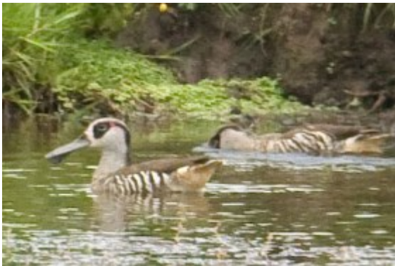
Jelat Jelat, Near Bega

Voice. Male:- A musical chirrup on the water and in flight. A sharp, high pitched "ee-jik" when alarmed.