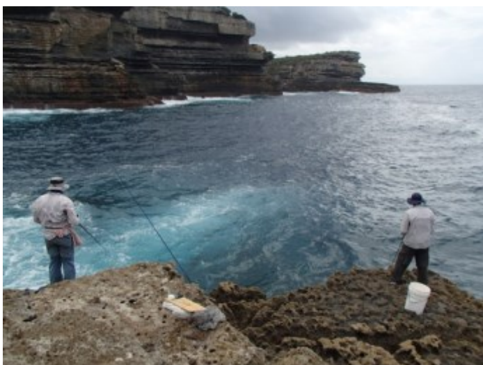
Phil turner and mate at The Planks on the Nowra Convention