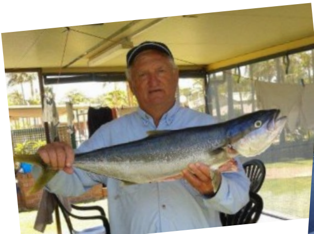
Sid Young's 997 mm king caught at Snapper Point, Pretty Beach