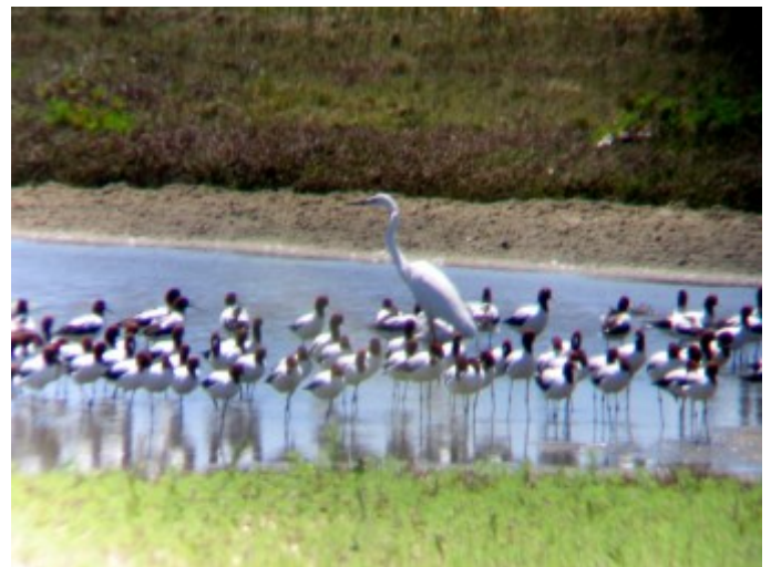
Part of a flock of several hundred at Stockton Sand Spit, accompanied by a Great Egret.